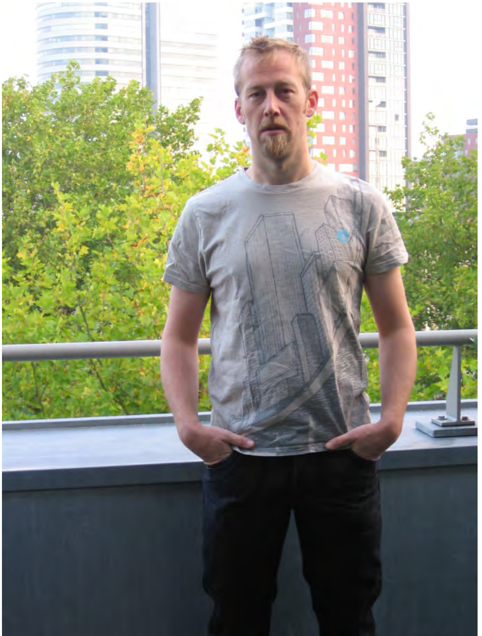
I watch and read news.